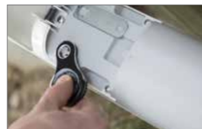
Possibility to unlock motor with transmitter