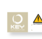
TS (1 pc)