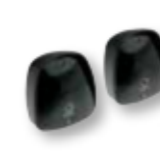
FT32 (1 pc)