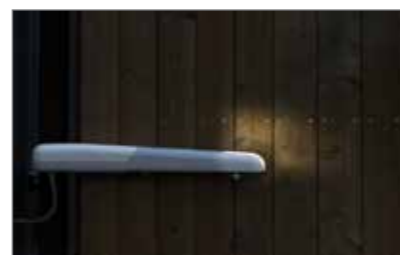
Brackets in line