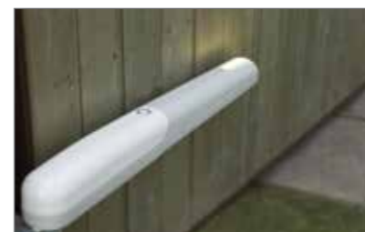
Stylish design screwless at sight