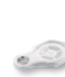
SUB-44WR (1 pc)