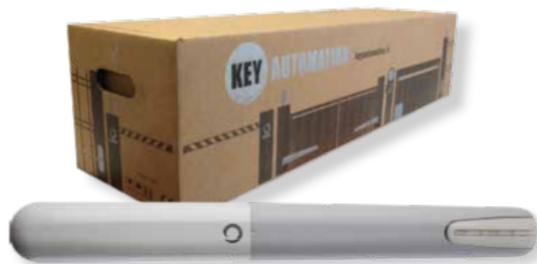
RAY2524 (2 pcs) RAY4024 (2 pcs) RAY40 (2 pcs)