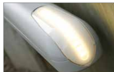
Built-in LED light mask

Manual unlock possible with Sub transmitter. Easy and user friendly