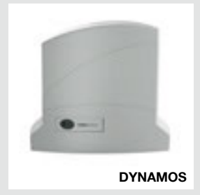
24 V version also available for markets with 110 V mains power supply