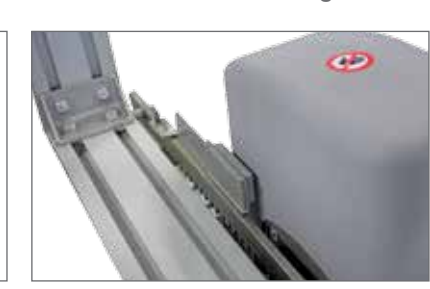
Magnetic limit switch