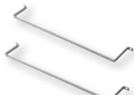
KITFIXBATT Kit fixing batteries 24 Vdc (for BOXKEY)