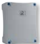
BOXKEY Plastic box for two motors control unit