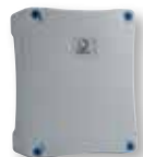
BOXKEYS Plastic box for one motor control unit