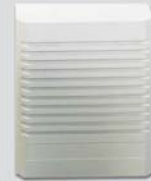
Wireless Internal Sounder