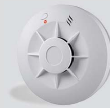
Wireless Smoke Detector