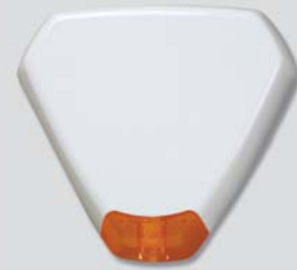
Wireless External Sounder