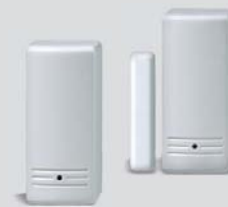
Universal Transmitters and Magnetic Contacts